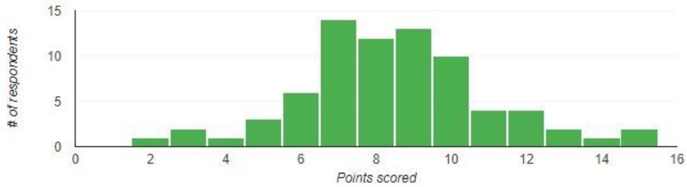
Total points distribution